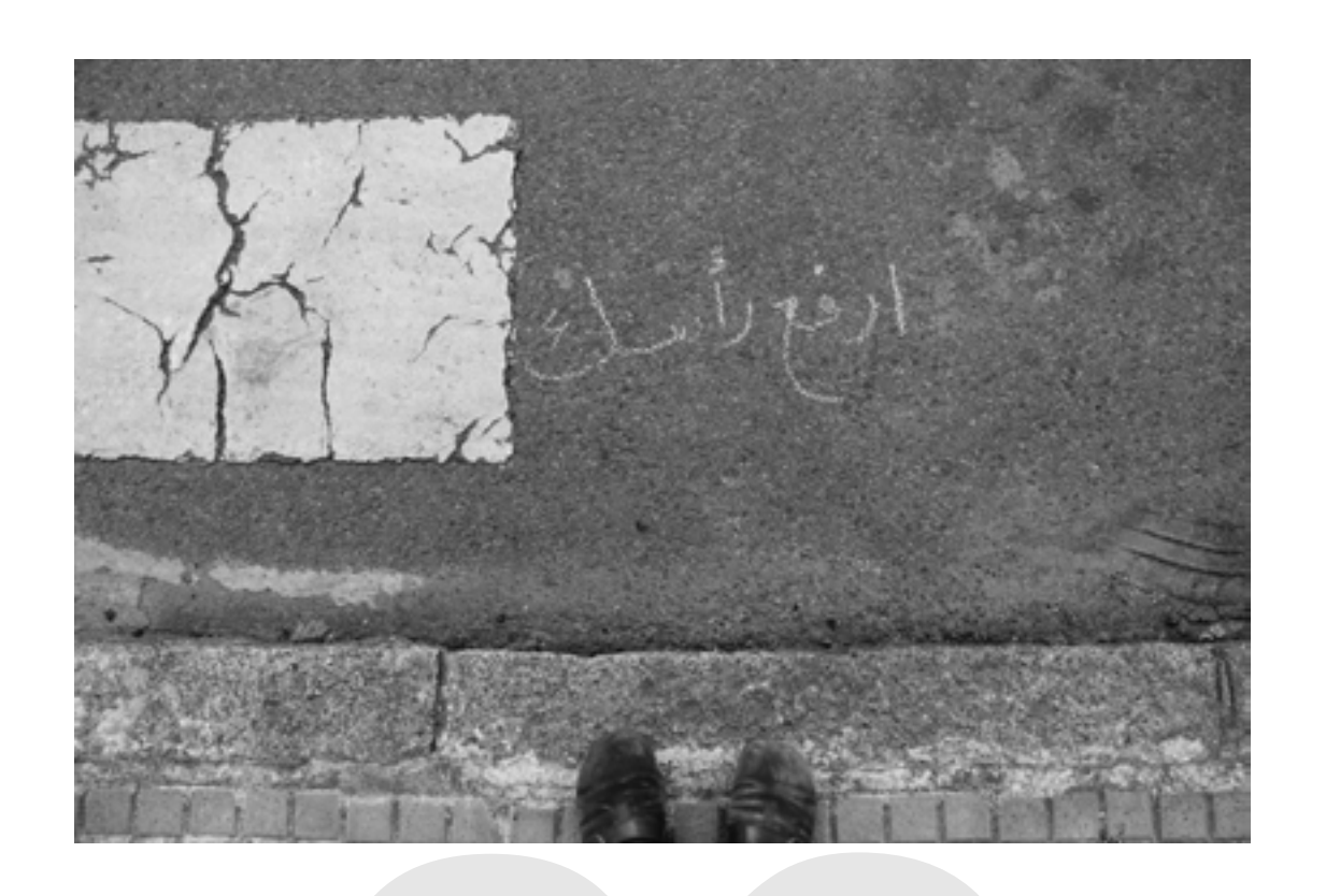
"Lift up your head", digital print on D bond

"Lift up your head" is a part of an ongoing project, in which I leave this Arabic sentence in places I walk through or visit. If you feel sad, depressed and you found yourself walking alone in the street while you are looking down without any hope or passion to do something, look carefully, maybe you will see this sentence in the floor to reminds you to upraise your head and see what is shining in the horizon, to hope for a better future."